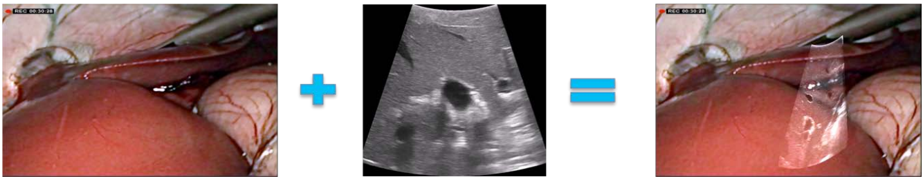
Figure 1 Real-time overlay of ultrasound image on laparoscopic video creates the novel augmented reality visualization.

We achieve our objective by integrating 2 real-time surgical imaging modalities: (1) newly emerged 3-dimensional (3D) laparoscopic camera technology that allows visualizing the surgical anatomy with the highest image quality currently available and perception of true depth, and (2) laparoscopic ultrasound capable of visualizing hidden structures. We call the resulting visualization capability stereoscopic augmented reality (AR) , in which 3D laparoscopic video (the reality) is augmented with ultrasound findings, especially the blood vessels, ducts and tumors (see Figure 1).