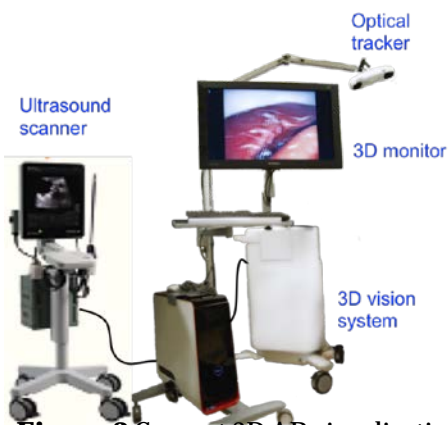
Figure 2 Current 3D AR visualization prototype.

We have a fully operational prototype as shown in Figure 2. This prototype has been tested in phantoms and animals and we have published these results [2, 3]. We have indeed taken care of protecting our IP and have a pending patent [4]. More recently, with IRB approval, we have begun testing the prototype clinically and have imaged the hepatobiliary anatomy successfully in three patients referred for laparoscopic cholecystectomy (see Figure 3). A movie clip showing the resulting AR visualization is available at https://www.youtube.com/watch?v=o2gRihy-wc . This novel mode of visualization clearly shows the bile ducts and, in this particular example, a stone in the cystic duct in the surgical field of focus. It should be appreciated that these internal structures would not be visible during a conventional laparoscopic procedure.